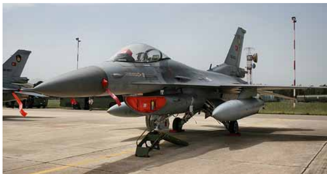
Turkish F-16

According to the U.S. International Trade Commission (USITC) , 1 America exported military goods worth $16.1 billion in 2008, constituting 1.4 percent of all U.S. exports for that year. Imports on the other hand, are still only a fraction of exports, thus driving a considerable trade surplus.