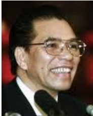
Nong Duc Manh

The good news is that Vietnam's leaders are likely to move the country in directions that will enhance its standing and growth, strengthen ASEAN, and open the door for closer ties with the United States and other international partners.