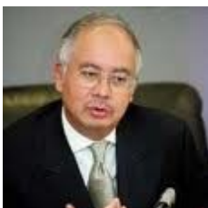
Malaysia PM Razak

On June 10, the United States and Indonesia signed a Framework Agreement on Cooperative Activities in the Field of Defense. This agreement is expected to pave the way for further cooperation in military training, defense procurement, and maritime security. However, the agreement does not cover the issue of providing military training for Kopassus, Indonesia's Special Forces unit.