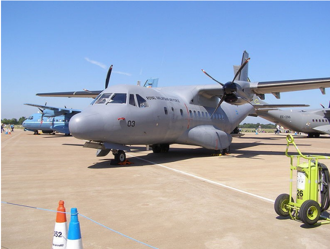
Royal Malaysian Air Force CASA CN-235, built by PT Dirgantara Indonesia

aircrafts, ships, armored vehicles and artillery, while Indonesia's exports consist primarily of transport and patrol aircraft and helicopters. None of the other ASEAN members have significant defense industrial bases, even by regional standards.